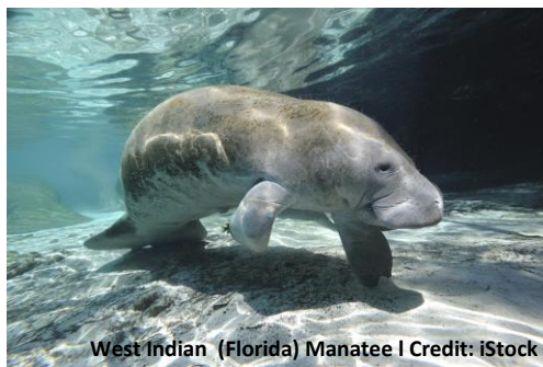
West Indian (Florida) Manatee

This project will provide supplemental equipment and staff capacity to capture and provide first response-care for distressed animals, recover carcasses, conduct thorough necropsy examinations to make cause of death determinations and efficiently transmit data to appropriate management agencies. Additionally, funds will be utilized to enhance data collection for Gulf-wide stranding events and related initiatives, and improve training for stranding network participating organizations to improve response efficiency, capability and coordination.