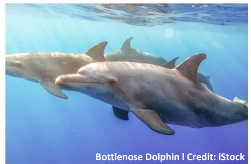
Bottlenose Dolphin