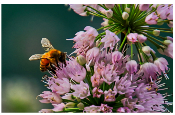
Bee pollinating chive blossoms, Chicago River

Conduct restoration activities on at least 500 acres in nature preserves near the Grand Calumet River and reconnect residents to the Grand Calumet River and associated dune and swale habitat through listening sessions, outreach, education and hands-on work. Project will create community-informed engagement report and improve habitat for wildlife such as Blanding's turtles, spotted turtles, Virginia rails, American bitterns and migratory birds.