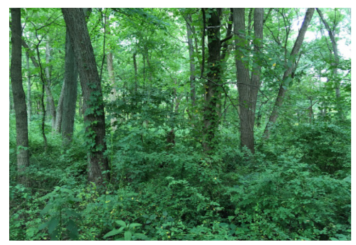
Before invasive species removal at Cranberry Slough project site