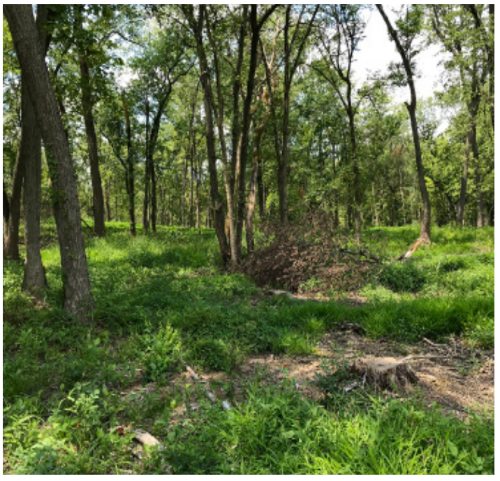
After invasive species removal at Cranberry Slough project site