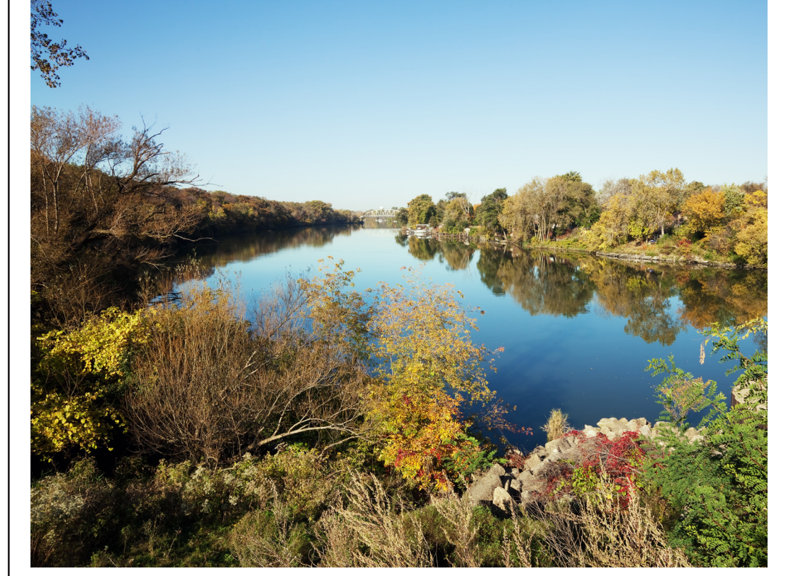
Calumet River, Chicago

life and their habitats. Created by Congress in 1984, NFWF directs public conservation dollars to the most pressing environmental needs and matches those invest-