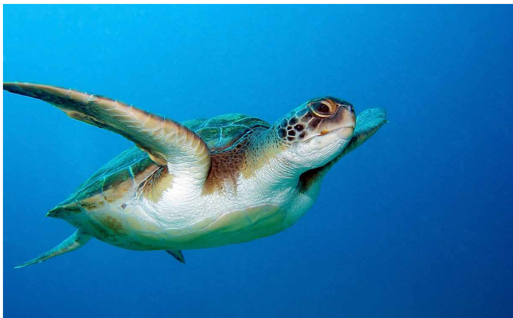
Loggerhead sea turtle

1133 15th Street, NW Suite 1000 Washington, D.C., 20005 202-857-0166