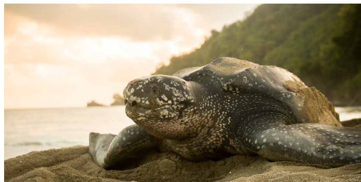
Leatherback sea turtle

Reduce threatened species bycatch and mortality (sea turtles, small cetaceans, seabirds) at priority sites in the Humboldt current region. Project will promote safer gear, provide broad scale outreach, training and capacity building to promote sustainable gillnet fishing in Peru and Ecuador.