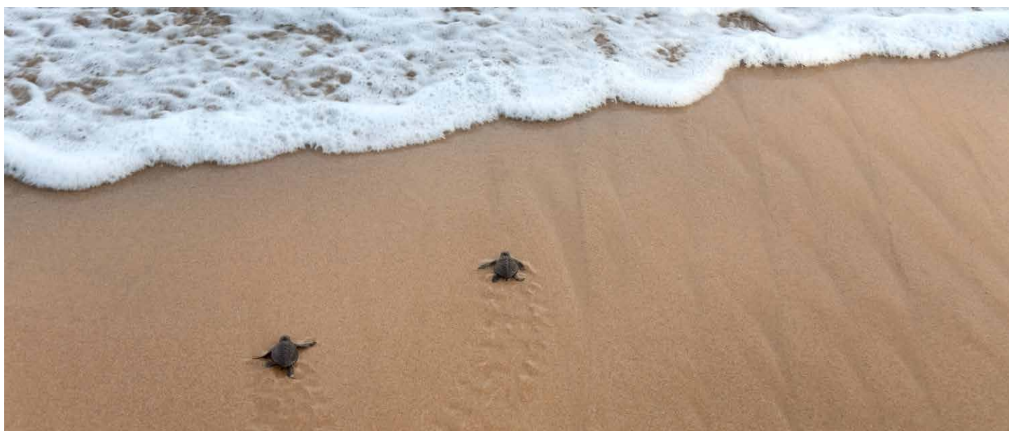
Loggerhead sea turtle hatchlings

Investigate the nesting population dynamics of leatherback sea turtles within and between the beaches of St. Croix and Puerto Rico. Project will monitor turtle movements using satellite tags through the nesting season to understand if populations are declining or shifting use of Caribbean beaches.