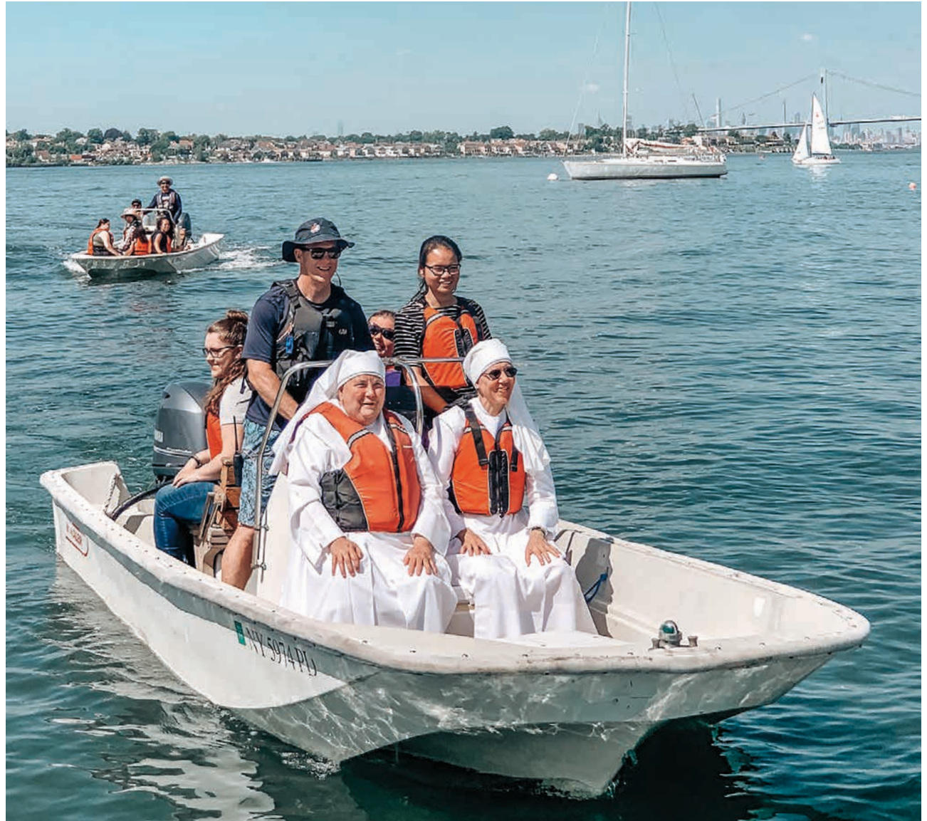
A Futures Fund grant supported an event at the SUNY Maritime College with on-the-water activities for everybody to experience the sound and learn about how to conserve it.

Long Island Sound faces many of the same issues that impact coastal communities across the United States. Small, diffuse sources of stormwater pollution, from plastics to fertilizer, drain into rivers that feed into the sound. Sewage pollution from wastewater treatment plants and aging residential septic systems forces the closure of beaches and shellfish beds. The loss of tidal wetlands — 27 percent loss in Connecticut and 48 percent loss in New York — has reduced the sound's