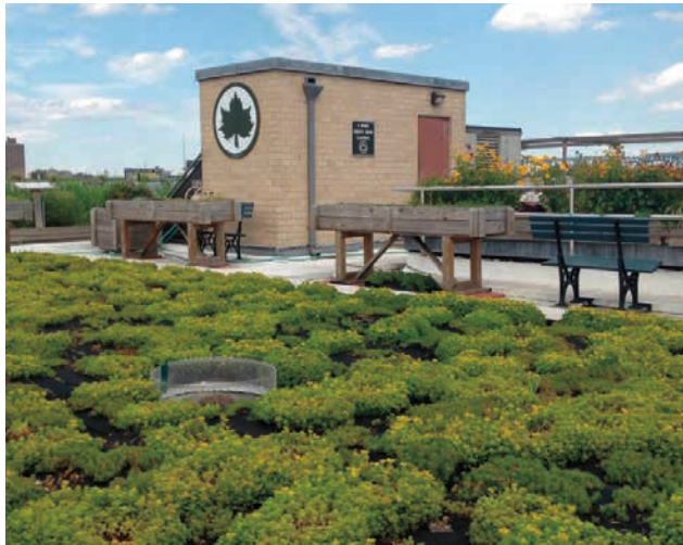
A Futures Fund grant for a green roof at a New York City park building prevents stormwater from entering the sound.