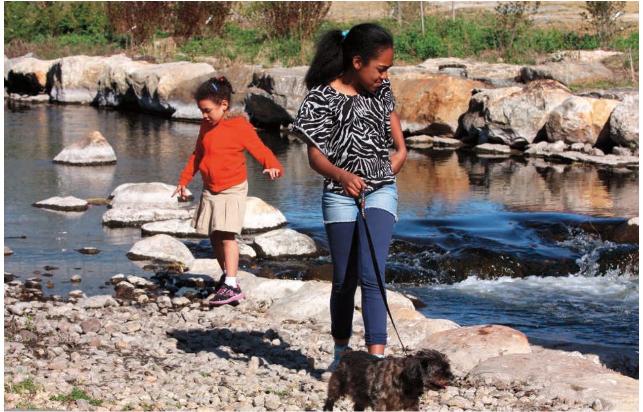
A Futures Fund grant installed green infrastructure in a park to improve water quality, public access and ecology along the Mill River.

By employing “green infrastructure” in this way, project leaders treated stormwater as a resource rather than a waste product. They capitalized on natural floodplain drainage patterns and park topography to capture and direct a majority of stormwater pollution from the surrounding streets and buildings into the swales and gardens, with a