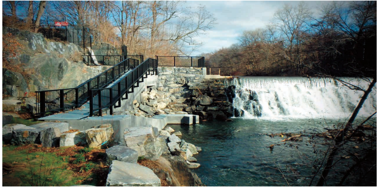
A Futures Fund grant allows alewives to swim up this fishway, bypassing a dam on the Bronx River to reach historic spawning grounds.

But, starting in Colonial times, hundreds and hundreds of dams and culverts have severed the connection these fish need to allow them to travel between the ocean, the sound and freshwater streams. Today, alewives are abundant only in rivers that are free of such barriers, where they can reach their spawning grounds.