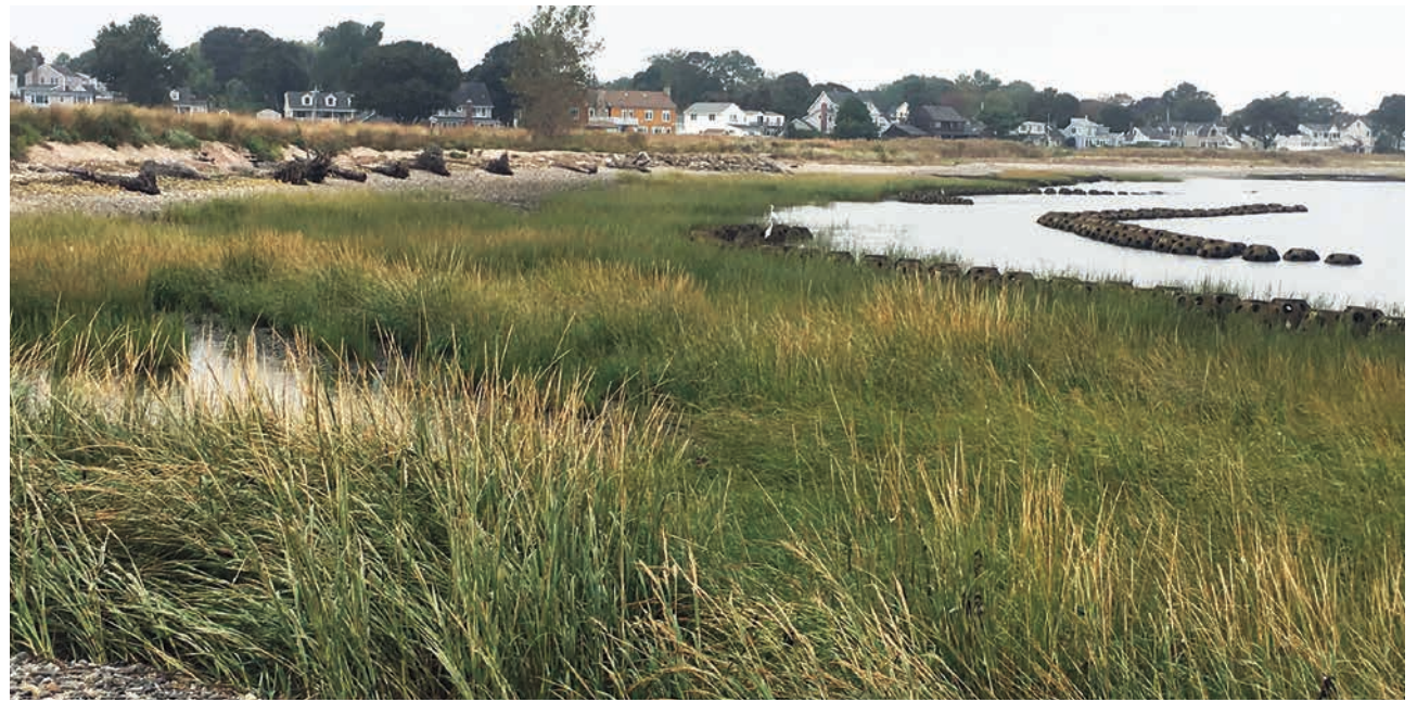
A Futures Fund grant supported a living shoreline at Stratford Point, providing habitat for marine life and a buffer against storms.

The Long Island Sound Futures Fund awarded $175,000 to Sacred Heart University, working in