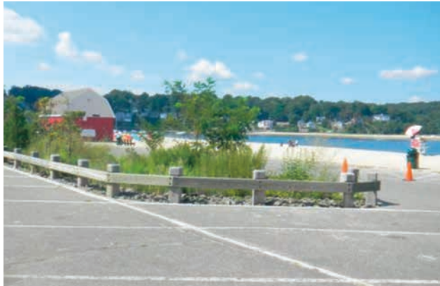
A Futures Fund grant used green infrastructure to collect stormwater from a building and parking lot, keeping pollution from entering the water at a local beach.