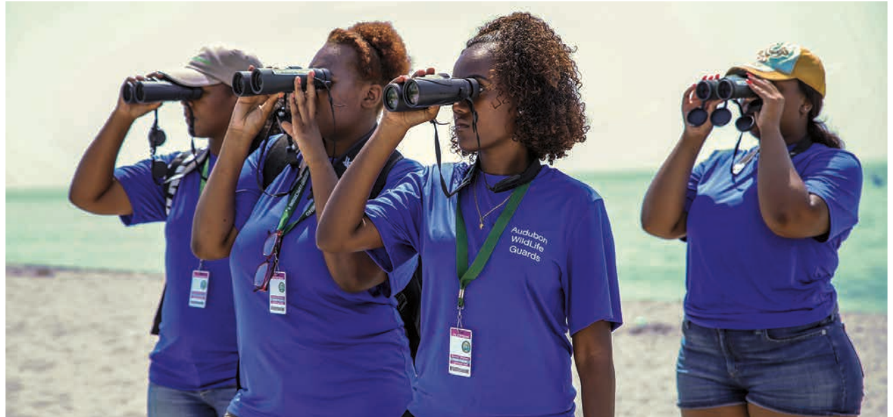
A Futures Fund grant enabled local youths to serve as wildlife guards of coastal birds at their community beach.

Abandoned in 1996 after a fire burned the bridge connecting it to the mainland, Pleasure Beach reopened in 2014. The Long Island Sound Futures Fund provided $41,000 to Audubon Connecticut to deploy student ambassadors as “Wildlife Guards” on