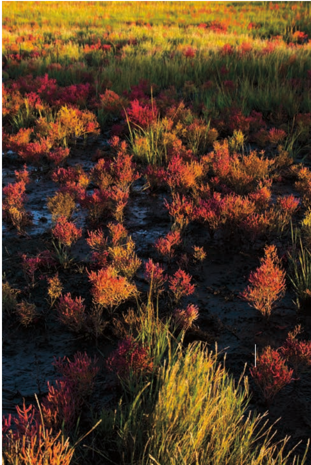
Healthy marsh in the Long Island Sound watershed