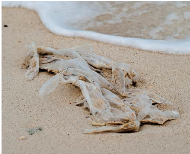
Six of the top 10 litter items collected in cleanups on the sound are made of plastic.

The Long Island Sound watershed is home to more than 9 million people, with 4 million of them living along its coast, making it one of the most heavily populated regions in the United States.