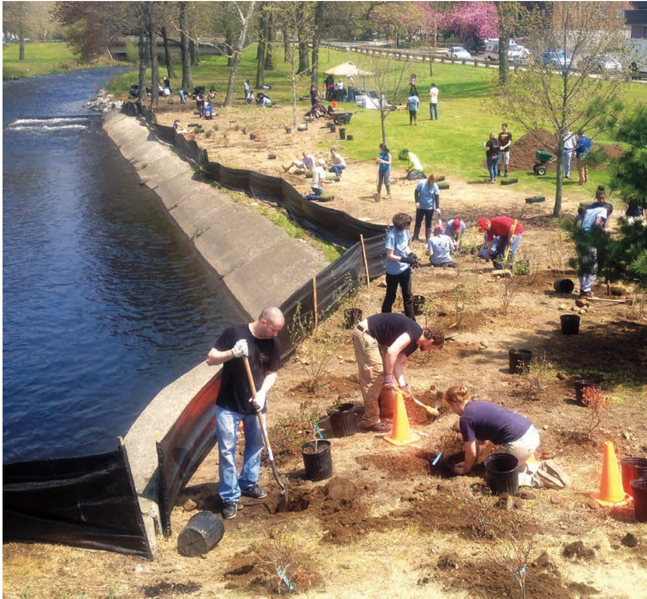
A Futures Fund grant supported volunteer-based riparian habitat planting along the Pequonnock River.

have supported projects that provide public education and engagement. And as a result of these grants, an estimated 3 million people have been reached over the past 15 years.