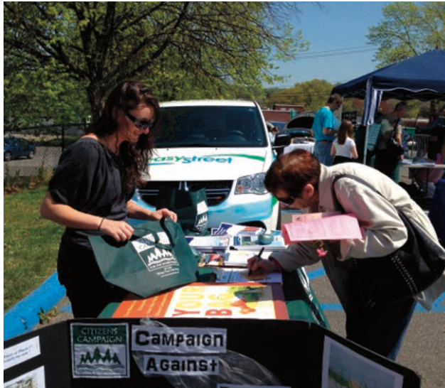
The Futures Fund provided a grant to ask people to sign written pledges to kick the plastics habit.