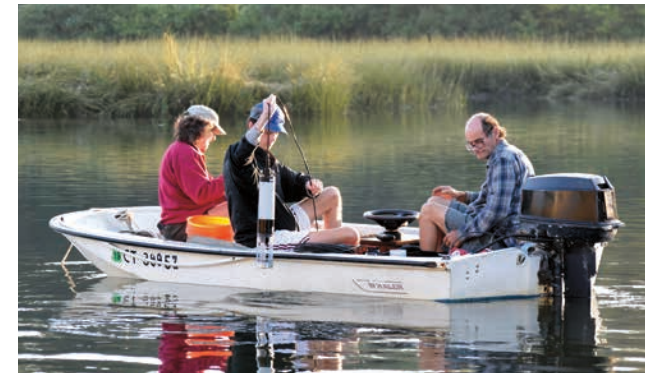
A Futures Fund grant supported development of an integrated monitoring framework to enhance citizen science and the utility and application of their data to management of the sound and its local waters.