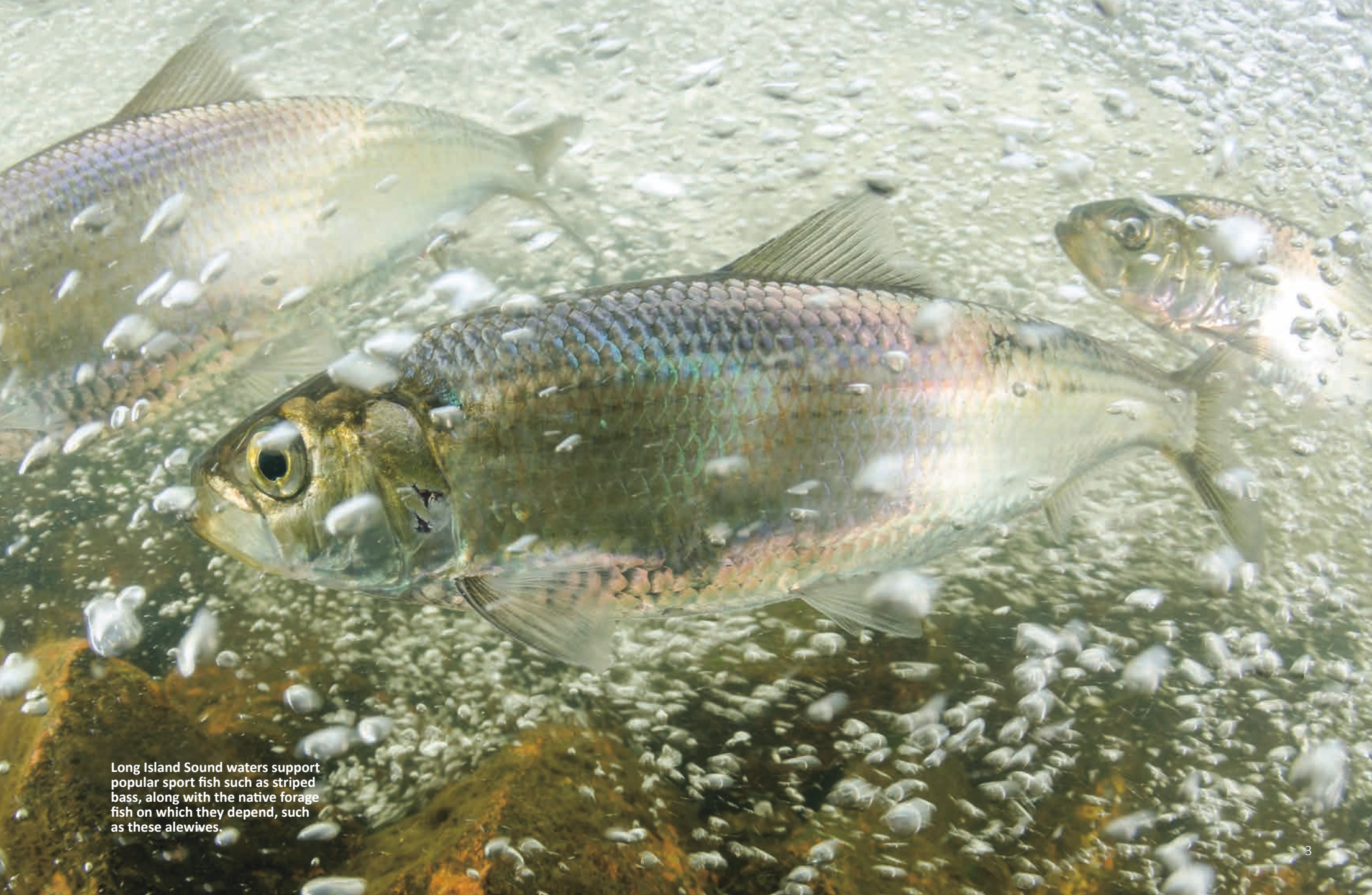
Long Island Sound waters support popular sport fish such as striped bass, along with the native forage fish on which they depend, such as these alewives.