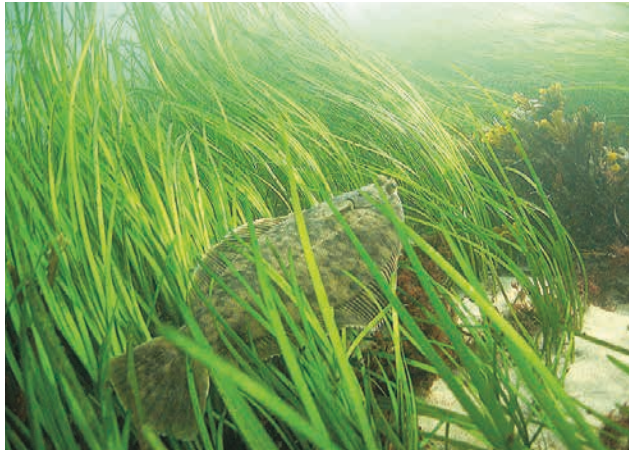
A Futures Fund grant restored eelgrass to improve water quality and provide habitat for fish such as flounder.