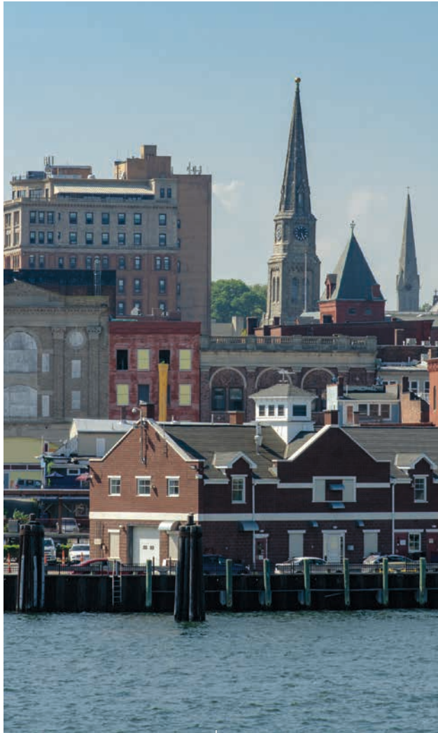
A Futures Fund grant supported resiliency planning in New London, Connecticut.