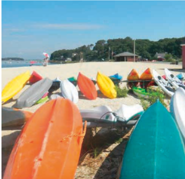
Health officials close beaches when heavy rains send polluted runoff pouring into local waterways.