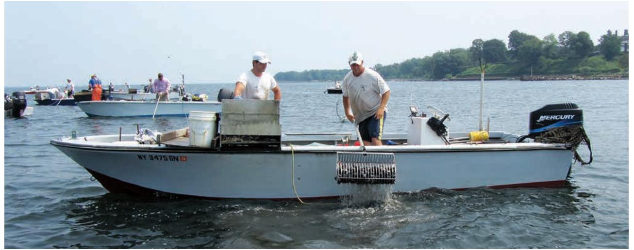
Harvesting clams in outer Hempstead Harbor.

After being closed for more than 40 years, 2,500 acres in the outer harbor reopened to shellfishing in 2011. What changed? The commitment of nine determined communities surrounding the harbor to identify and respond to sources of pollution. How did this happen? The commitment of a dedicated corps of citizen-scientists monitoring local water quality beginning in