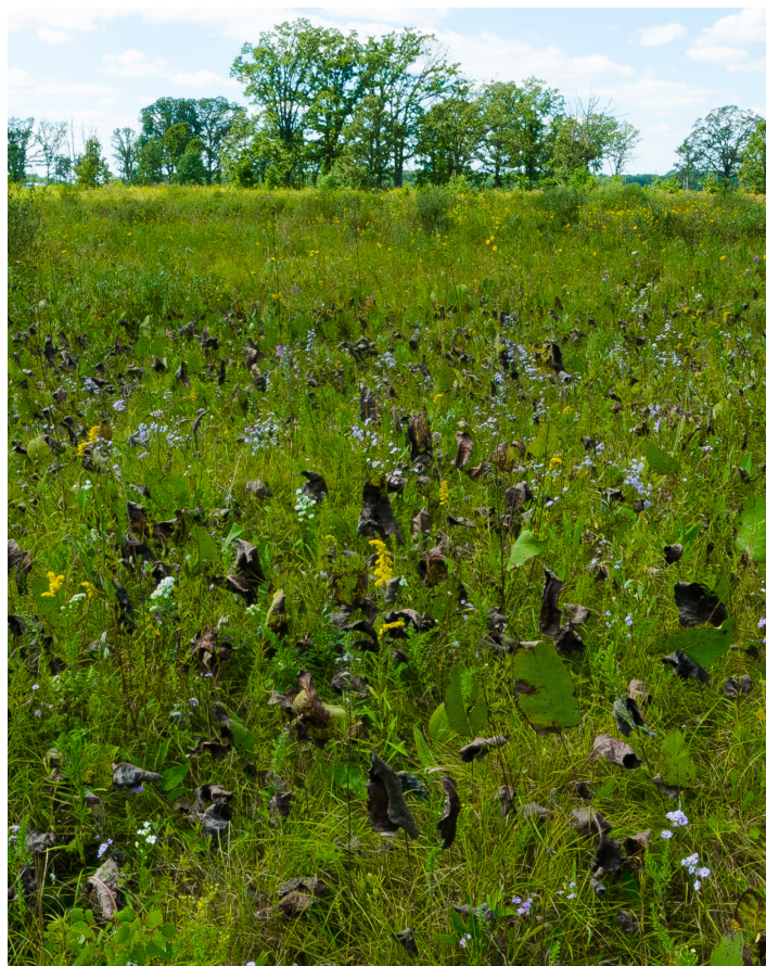
Wet-mesic prairie, Wisconsin

Maintain and protect the ecology of three gorges and stream ecosystems in Ithaca and Trumansburg, New York by surveying and treating invasives. Project will restore 77 acres of habitat and protect 11.4 miles of tributaries of Cayuga Lake from pale swallowwort, Japanese knotweed, porcelainberry and phragmites.