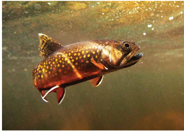
Brook trout rely on clean, cold streams throughout the Great Lakes basin.