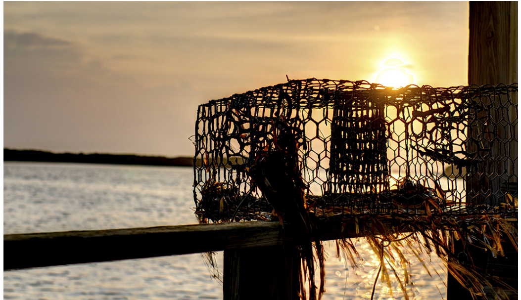
An abandoned crab pot in Florida

1133 15th Street, NW Suite 1000 Washington, DC 20005 202-857-0166