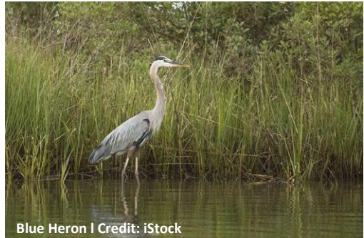
Blue Heron

This project will fund due diligence and planning needed to identify specific, high-priority properties for future acquisition, with a goal of preserving intact undeveloped intertidal habitat within the City of Mobile. Specific focal priorities include restoring and conserving habitats which support estuarine and marine fisheries and wildlife, including, up to 300 acres of riparian, wetland, and upland habitats in the Dog River Watershed (Perch Creek) near its connection to Mobile Bay; up to 40 acres of bay shore property in the Garrows Bend Watershed connecting to Helen Wood Park on the mouth of Dog River; and up to 450 acres in the lower reaches of the Three Mile Creek Watershed, which will advance the recommendations of the Three Mile Creek Watershed Management Plan. Work to be completed during Phase I includes site-specific assessments of the ecological value and net environmental benefit of protecting identified coastal habitats; real estate due diligence on key parcels; and preliminary restoration and long-term management planning for priority parcels.