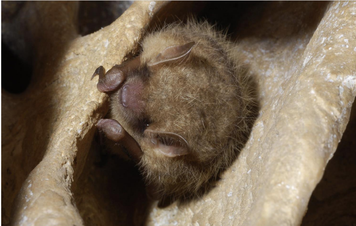
Tri-colored bat