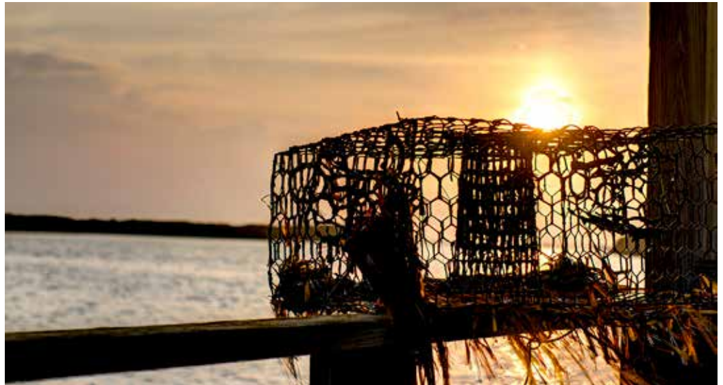
An abandoned crab pot in Florida

1133 15th Street, NW Suite 1000 Washington, DC 20005 202-857-0166