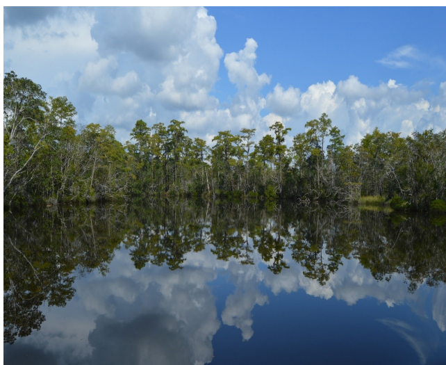
The picture above shows hardwood forest habitats on the Blackwater River. Acquiring this tract protects the habitat and wildlife species in the Blackwater and Perdido river system.

The property has been conveyed to the state of Alabama for inclusions and management as part of the Alabama Forever Wild Land Trust. Acquisition and permanent protection of the proposed tract will protect and conserve a diversity of coastal habitat types and support many wildlife species impacted by the Deepwater Horizon oil spill. The project builds upon previous acquisition investments made within the area by Alabama Forever Wild, the state of Florida, and the Northwest Florida Water Management District, which are working together to protect this important river corridor.