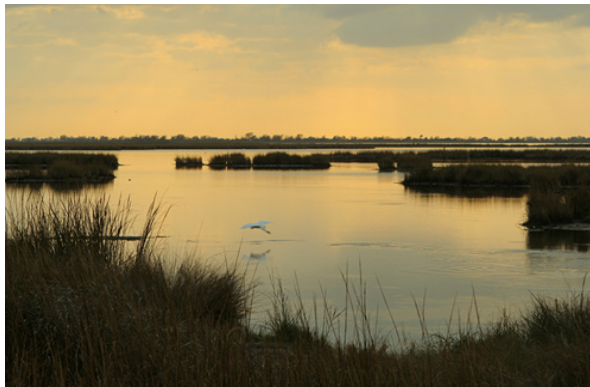
Restoration of 14 acres of wetlands, including the 6 acres of Mon Louis Island, will restore critical habitat at the mouth of Fowl River.

The Fowl River Watershed drains much of southern Mobile County into the southwestern portion of Mobile Bay, and contains the three habitat types identified by the Mobile Bay National Estuary Program as most stressed – freshwater wetlands; intertidal marshes and flats; and rivers, streams, and associated riparian areas. The watershed faces loss of wetlands, shoreline erosion and sedimentation from increasing land development and intensified human use.