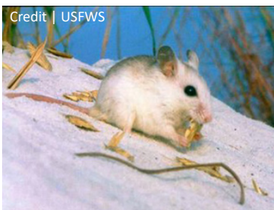
Coastal dunes under threat of residential development are now protected by this acquisition. This is critical habitat for the endangered Alabama beach mouse, pictured above.