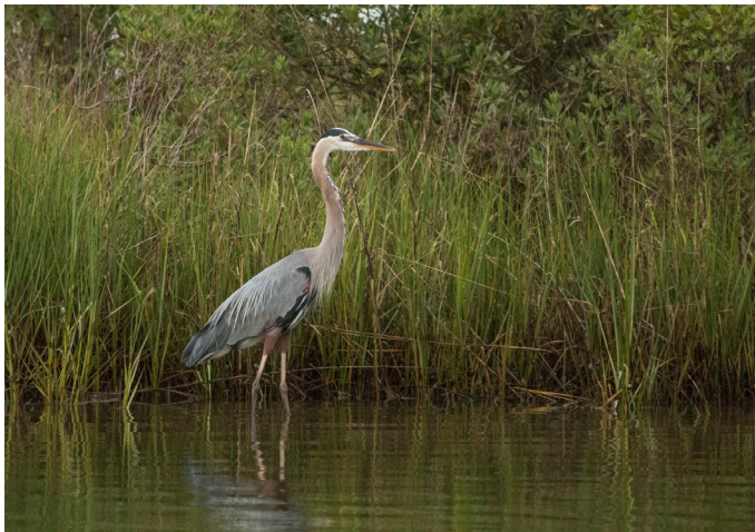
Acquiring priority acreage in the Dog River Watershed will protect important wetland habitat and bird species, such as the blue heron pictured above.

The proposed parcel locations have been identified as priority wetland preservation areas within the Mobile Bay National Estuary Program's Dog River Watershed Management Plan, funded by GEBF. Project activities will address wetland conservation goals listed as a top priority in the Mobile Bay National Estuary Program's Comprehensive Conservation Management Plan.