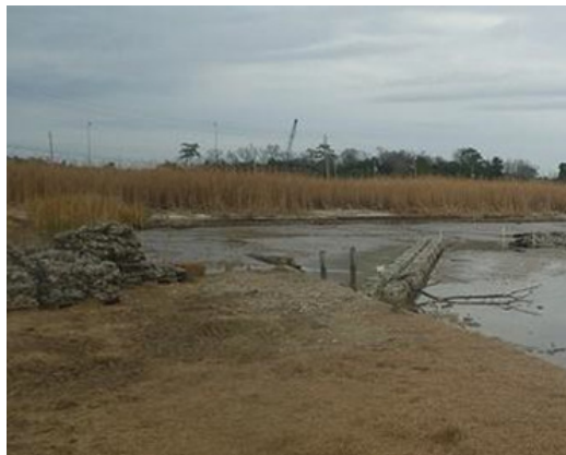
This project will conduct the due diligence necessary to identify high-priority properties for future acquisitions and restoration, similar to the engineered living shoreline restoration pictured above.

This project will fund due diligence and planning needed to identify specific, high-priority properties for future acquisition, with a goal of preserving intact undeveloped intertidal habitat within the City of Mobile. Specific focal priorities include restoring and conserving habitats which support estuarine and marine fisheries and wildlife, including, up to 300 acres of riparian, wetland, and upland habitats in the Dog River Watershed (Perch Creek) near its connection to Mobile Bay; up to 40 acres of bay shore property in the Garrows Bend Watershed connecting to Helen Wood Park on the mouth of Dog River; and up to 450 acres in the lower reaches of the Three Mile Creek Watershed, which will advance the recommendations of the Three Mile Creek Watershed Management Plan. Work to be completed during Phase I includes site-specific assessments of the ecological value and net environmental benefit of protecting identified coastal habitats; real estate due diligence on key parcels; and preliminary restoration and long-term management planning for priority parcels.