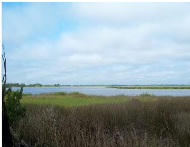
The 223-acre property has long been a high priority target for conservation and includes significant high quality acreage of both tidal marsh and maritime forest, as pictured above.