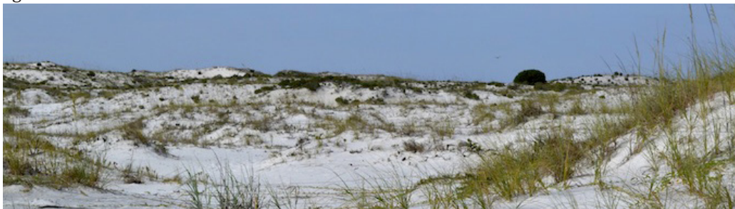
GEBF funds will restore dune habitats to enhance Florida’s coastline for dune species. The picture above represents a healthy dune habitat.

The project seeks to restore and conserve coastal dune habitat through restoration of ecological function across a wide geographical area. Projects to restore and maintain the ecological functions of landscape-scale coastal habitats are a top priority under the Florida GEBF Restoration Strategy. Proposed project activities will also address the need for greater connectivity within the coastal dune system as outlined in U.S. Fish and Wildlife Service’s Strategic Plan for the Gulf Coast. Outcomes of the project will restore the connectivity of the coastal dune system, benefitting several species including shorebirds, sea turtles and endangered beach mice while also strengthening the system against the threat of future harm.