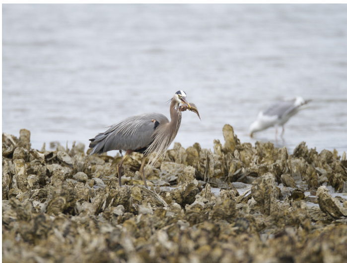
The creation of this living shoreline will provide foraging habitat to great blue herons, pictured above, and other wading bird species.

This project complements a suite of 2019 GEBF awards intended to restore oysters in Apalachicola Bay.