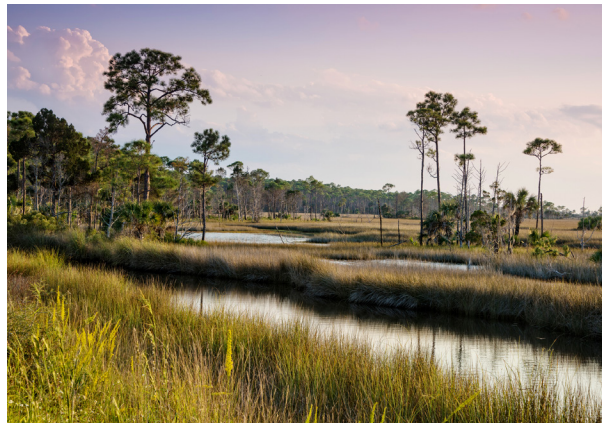
This project will restore saltmarsh habitat, as pictured above, along the St. Marks River.

Restoration of coastal marsh and estuarine habitats remain a high priority focal area for the state of Florida under the Florida GEBF Restoration Strategy, is identified in the St. Marks NWR Comprehensive Conservation Plan, the St. Marks River and Apalachee Bay Surface Water Improvement and Management Plan, and the State Wildlife Action Plan.