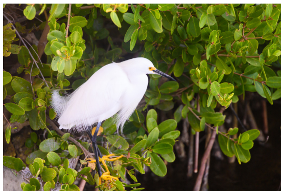
This project will restore wetland and rookery habitat for wading birds like the snowy egret pictured above.

Restoration and enhancement of Wulfert Bayous supports goals and objectives to conserve habitat and protect living coastal resources for the wading bird populations as stated in A Comprehensive Restoration Plan for the Gulf of Mexico, the Greater Everglades Ecosystem Restoration Plan, and the Southwest Florida Feasibility Study. The project was identified by the U.S. Fish and Wildlife Service as a high priority for restoring populations of wading bird species impacted by the oil spill.