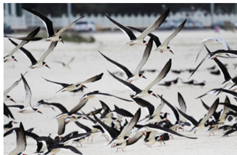
Over the course of the project 115 volunteers were recruited and trained and contributed more than 2,500 hours, pictured in the above left. Three Audubon Coastal Bird Survey trainings were held and eight colonies of shorebirds, like black skimmers pictured in the above right, were protected by signage and roping.