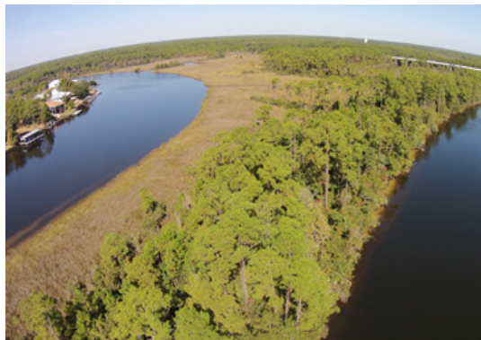
This project leverages earlier investments to expand invasive species management in important Mississippi coastal habitats.

Consistent with Mississippi's desire to restore and maintain the ecological function of landscape-scale coastal habitats, this project focuses on improving significant coastal marsh and transitional upland habitat through the control and eradication of non-native and invasive plant species and the improved tidal connectivity of these habitats to the Mississippi Sound. Mississippi's coastal wetlands, as well as adjacent upland habitats, like wet pine savanna and pitcher plant bogs, are among the most biologically productive and ecologically diverse natural systems within the state. Mississippi's protected lands are significant wildlife habitat for neotropical migratory birds and shorebirds as well as resident marsh birds, wading birds, and land birds. The maritime forest and pine uplands provide important nesting and roosting area for birds and buffer surrounding marsh habitat.