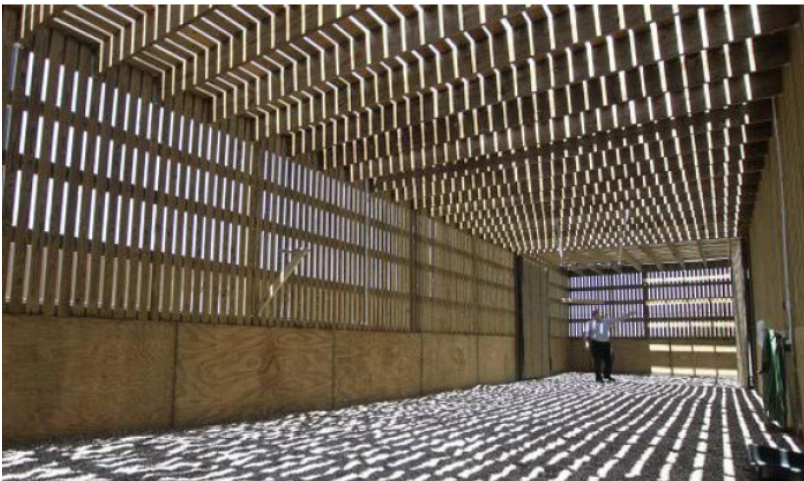
This project will repair a damaged flight cage, above, is the interior of the flight cage before Hurricane Harvey.

The Animal Rehabilitation Keep, is a facility dedicated to the rehabilitation of sea turtles and marine birds along the coast of Texas and throughout the region. The facility is located on Mustang Island and St. Joseph Island near Port Aransas, Texas, and is one of the few facilities available to treat injured wildlife along the Texas Mid-Coast.