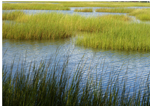
This project expanded the Anahuac refuge by acquiring valuable wetlands and coastal habitat.