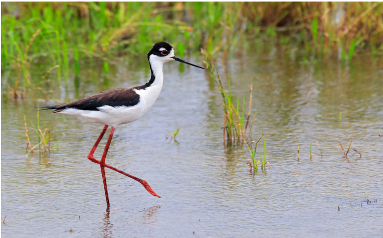
Above, a picture of black-necked stilts at Buffalo Lake Marsh. Funds from GEBF will support bird species like these by enhancing management of wetland habitats.

Project outcomes will improve habitat for several Gulf Coast bird species identified as Species of Greatest Conservation Need in TPWD’s Conservation Action Plan and Priority Species identified by Gulf Coast Joint Venture (GCJV). Habitats that will be enhanced as part of this project within the Buffalo Marsh Complex are supported by priority habitat objectives in multiple GCJV conservation plans.