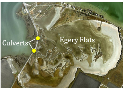
The restoration of the 600 acre Egery Flats basin will enhance important habitat for birds and marine species in Aransas Bay.