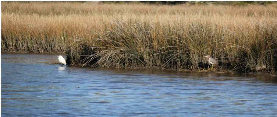
This project will enhance intertidal wetland habitat similar to the wetlands pictured above.

The Brazoria National Wildlife Refuge is a 44,000 acre refuge along the mid-coast of Texas that is teeming with wildlife and a diversity of marsh and upland coastal prairies. Constituting over 20% of the refuge, the Chocolate Bay Prairie Unit is high quality habitat for a diversity of grassland and coastal dependent birds. Alterations to the natural hydrology of the landscape from ditching, diking and installation of irrigation channels have reduced habitat quality for wetland dependent wildlife including resident and wintering waterfowl, wading birds and migrating shorebirds. These alterations and reduction of sheet flow also likely resulted in the reduction of water quality for waters that ultimately flow into Chocolate Bay.