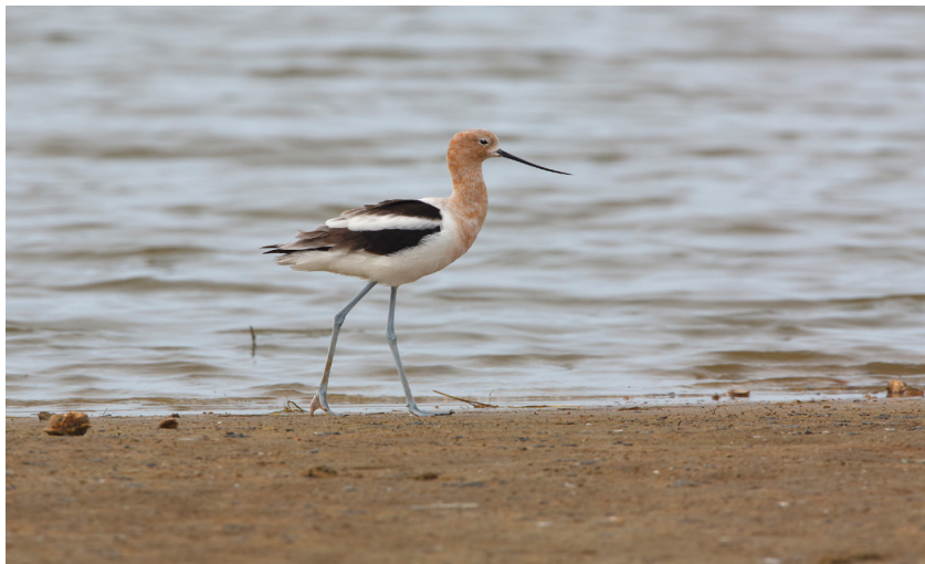
This acquisition will permanently protect coastal marsh habitat in the Mission River Delta to benefit numerous coastal species, such as the avocet pictured above.

The proposed acquisition sites are adjacent to existing and proposed conservation areas and will contribute to a large intact conservation corridor throughout the Mission River Delta. Permanent protection of the proposed site supports conservation goals in local and regional conservation plans, multiple goals within the federal and state approved Coastal Bend Bays Plan and the Gulf Coast Ecosystem Restoration Council's Comprehensive Plan.