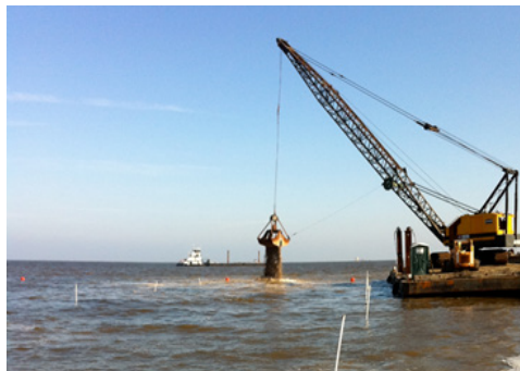
The addition of 30 acres of suitable oyster cultch will provide essential substrate for continued oyster recovery in eastern Galveston Bay.