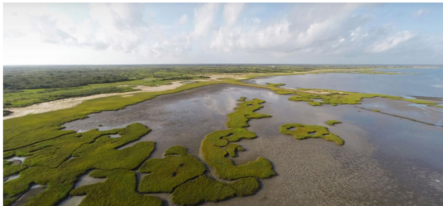
Acquisition and restoration of the 17,351 acre Powderhorn Ranch will significantly strengthen the existing network of Texas mid-coast conservation areas.

Due to Powderhorn Ranch's proximity the Aransas National Wildlife Refuge and other conservation lands, this project offers the opportunity to protect and strengthen a unique mosaic of coastal habitats along Texas's mid-coast. The ranch includes more than 11 miles of tidal bay front sheltering substantial nearshore seagrass beds and mollusk reefs, which provide extremely important nursery habitat for shrimp, crabs and finfish. The ranch also includes thousands of acres of emergent wetlands including extensive tidal marshes, bayous, fresh and intermediate potholes, and wet prairie that support waterfowl, shorebirds and wading birds. Powderhorn Ranch has been a top priority land acquisition for state, federal and non-profit partners for over twenty years and was recognized as the largest remaining component in a long-term strategy to conserve Texas's coastal ecosystems.