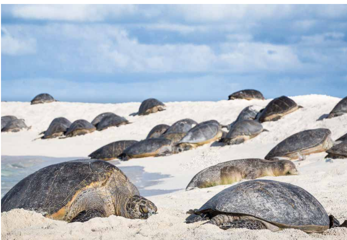
Monk seal and green sea turtles

The Fund's investments are provided to support management across the Monument, however an initial focus has been placed at French Frigate Shoals as a hot spot for endangered wildlife within the Monument and a case study for addressing management challenges and threats that are found throughout its boundaries.