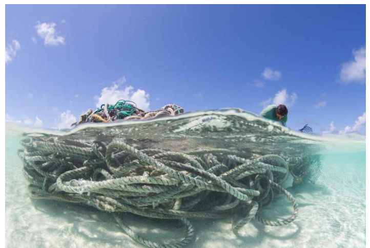
Marine debris at French Frigate Shoals