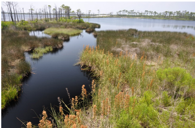
The target parcels include important coastal marsh habitat, similar to the picture above, that will be protected in perpetuity and be open to the public for passive recreational use.

These acquisitions will be occurring within the boundaries of the City of Gulf Shores, one of the fastest growing communities in south Alabama, and will eliminate the likely risk of future development. In addition, these acquisitions will expand existing preserved lands, including an adjacent unit of the Bon Secour National Wildlife Refuge and other city- and county-owned conservation lands.