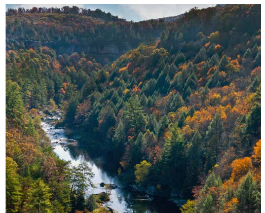
Obed River, Tennessee