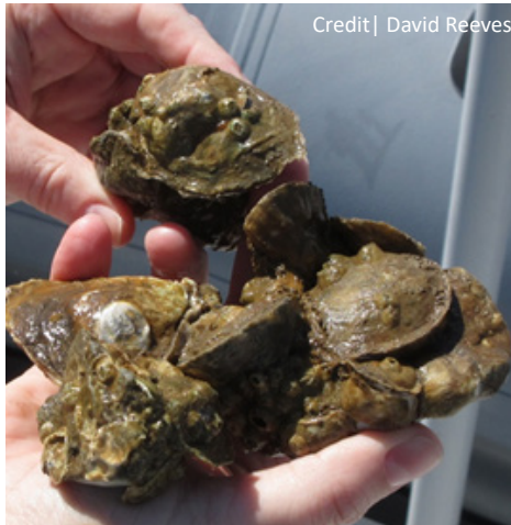
This project will construct reef restoration for oysters, pictured above, within the Apalachicola Bay.

Results from NFWF's previous investments in Apalachicola Bay oyster restoration research will be used to inform the design and management of this reef restoration initiative. This project also includes the development of oyster harvest management strategies for Apalachicola Bay and Suwanee Sound to ensure sustainability of the restored reefs. In addition, a recent $8 million Triumph Gulf Coast grant to Florida State University will collect critical water quality and hydrodynamic information to inform the optimal location for cultch deployments. Oyster restoration in the Apalachicola Bay is a high priority activity identified in the Florida GEBF Restoration Strategy and a number of other restoration plans.