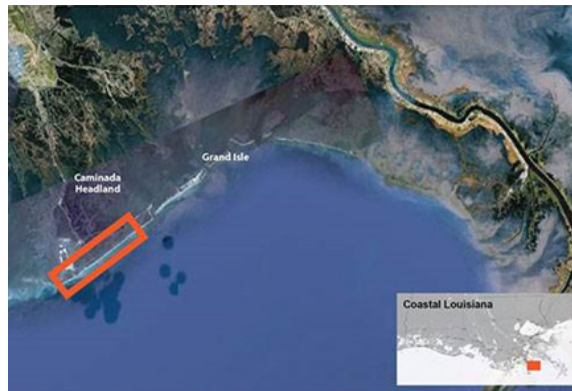
This project completed engineering and design for restoration of 490 acres of barrier shoreline habitat.

A restored beach and dune system will protect sensitive landward marshes and maritime forests from erosion and saltwater influences. In addition, these beaches and dunes serve as a source of sand for nourishing islands immediately to the east and west of the project, including Grand Isle- Louisiana's only populated barrier island. The beaches and dunes also provide storm buffering to Port Fourchon. In conjunction with other ongoing work, restoration of Caminada Headland will complete restoration of the chain of barrier islands that define Barataria Bay, consistent with the goals of the Louisiana's Coastal Master Plan.