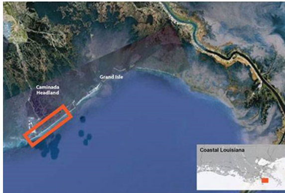
This project completed engineering and design for restoration of 490 acres of barrier shoreline habitat.

A restored beach and dune system will protect sensitive landward marshes and maritime forests from erosion and saltwater influences. In addition, these beaches and dunes serve as a source of sand for nourishing islands immediately to the east and west of the project, including Grand Isle- Louisiana's only populated barrier island. The beaches and dunes also provide storm buffering to Port Fourchon. In conjunction with other ongoing work, restoration of Caminada Headland will complete restoration of the chain of barrier islands that define Barataria Bay, consistent with the goals of the Louisiana's Coastal Master Plan.