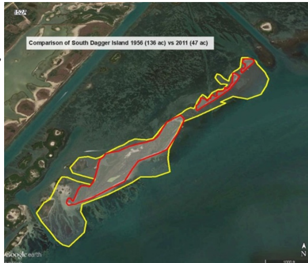
As displayed in the above aerial photo, Dagger Island has decayed significantly over the past 50 years.

Dagger Island was once a nearly contiguous island separating Corpus Christi Bay and Redfish Bay. Island degradation and shoreline erosion from natural and anthropogenic causes (e.g., shipping and dredging associated with the Corpus Christi Ship Channel) have significantly decreased the size of the island into a chain of smaller islands and altered the function and values they provide to the Redfish Bay system. These low lying islands have sand and shell hash shorelines leading to scarped banks that transition to typical high marsh vegetation including patches of mangrove on the Corpus Christi Bay side (south) of the island. Additionally, Redfish Bay contains the northernmost extensive stands of seagrass on the Texas coast and is unique in that it is one of three bays that contain all five species of native seagrass in Texas. The entire area is critically important for a number of species, including finfish, shrimp, blue crab, and sea turtles.