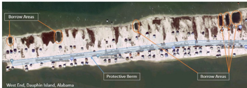
The map above shows the location of borrow pit areas created to build a protective berm on the West End of Dauphin Island. Restoring the borrow pits would strengthen the resiliency of the island and protect habitat for piping plovers, and other shorebirds.

A potential breach on the west end of Dauphin Island, like that experienced during Hurricane Katrina, would significantly alter salinity and water quality of the Mississippi Sound, negatively impacting oyster reef and fisheries habitat. The west end of Dauphin Island provides important nesting and foraging habitat for endangered and threatened species of shorebirds, including piping plovers. Dauphin Island regulates salinity regimes in the Mississippi Sound while protecting associated marsh habitat from storm-related damage.