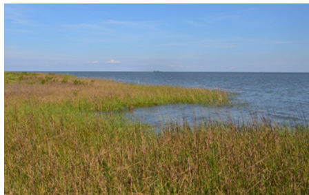
This project restored and protected between 8,000 and 17,000 acres of coastal wetland similar to that pictured above.

The project area is located between the Atchafalaya River and Bayou Lafourche and received very little influence from the Mississippi River through those two distributary channels. The decrease in freshwater has resulted in increased saltwater intrusion, while lower sediment inputs has compounded high subsidence rates and reduced the ability of marshes to maintain their elevation in relation to sea level; together, these factors have contributed to the highest rates of land loss in coastal Louisiana. The project resulted in an additional 8,000 - 17,000 acres of wetlands in 50 years in comparison to the future-without-project condition.