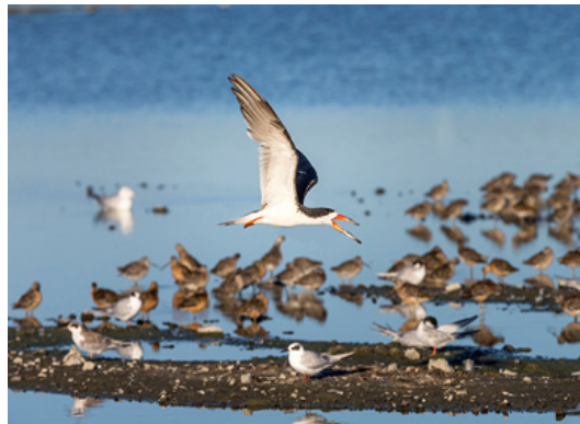
This project enhanced two bird nesting islands that support species such as the Reddish egret (left) and Black skimmer (right) pictured above.