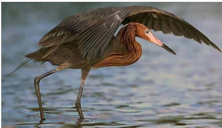
This project protected and enhanced areas that support dozens of species of fish and birds, like the reddish egret pictured above.

Overall, the protection of this critical coastal habitat contributed to the larger landscape scale conservation efforts in West Galveston Bay, which has lost over 35,000 acres of intertidal wetlands since the 1950s. Historical subsidence coupled with shoreline erosion has greatly impacted these areas, converting marsh to open water and threatening important habitat and feeding grounds for dozens of species of birds and estuarine-dependent species including shrimp, red drum, and blue crab.