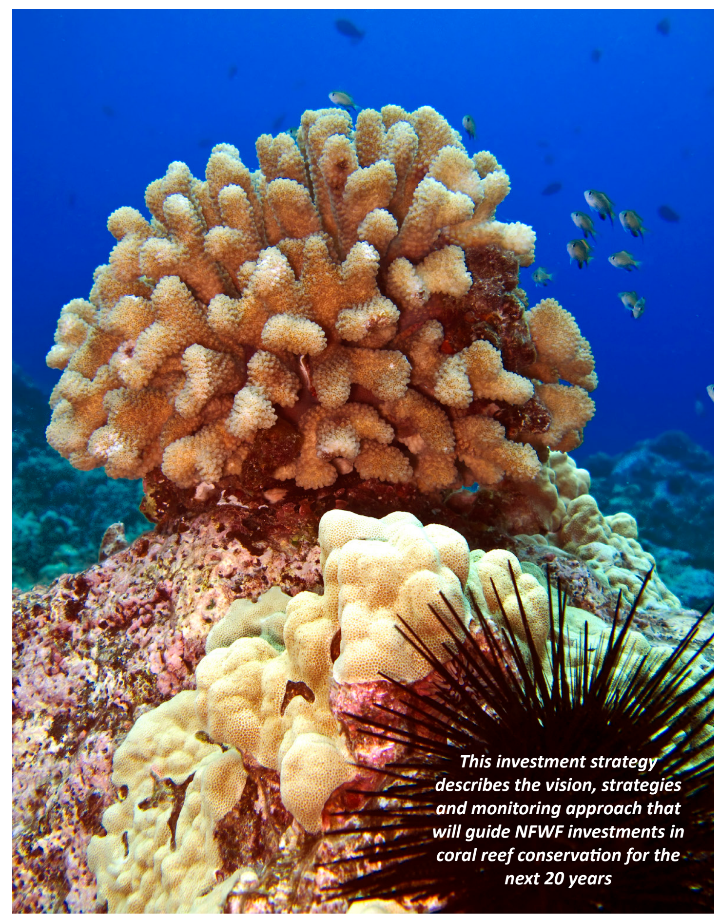
Coral restoration site in Hawaii enhanced by NFWF grant-making