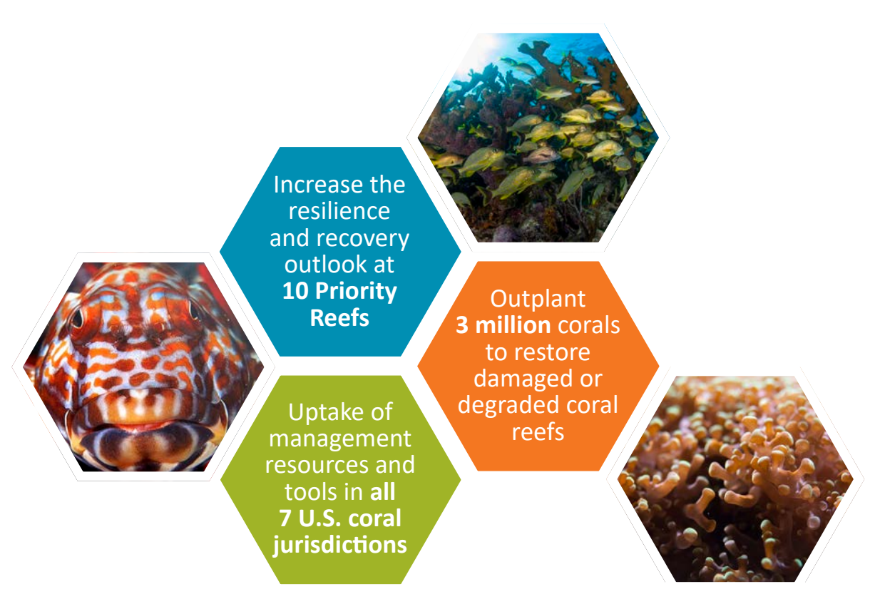
Initial targets of the Coral Reefs Investment Strategy