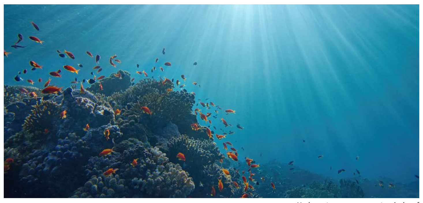
Underwater sun rays on a tropical reef

ON THE COVER: NFWF supports conservation efforts in coral reefs in the Northern Mariana Islands