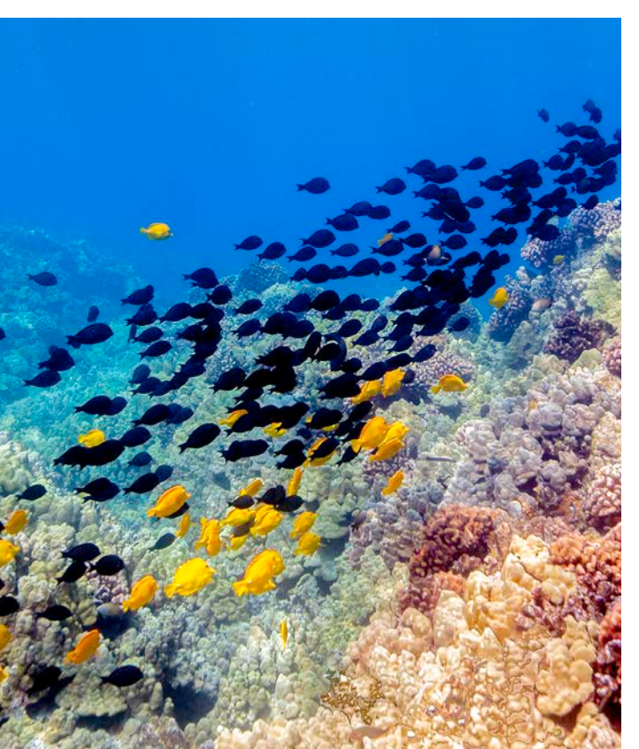
Coral reef in Hawaii