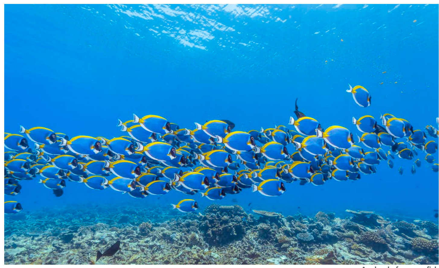
A school of surgeonfish