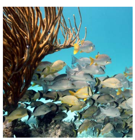
Photos clockwise from top left: coral reef in Hawaii, oil spill, coral bleaching, fish and coral, coral, hurricane on the gulf coast