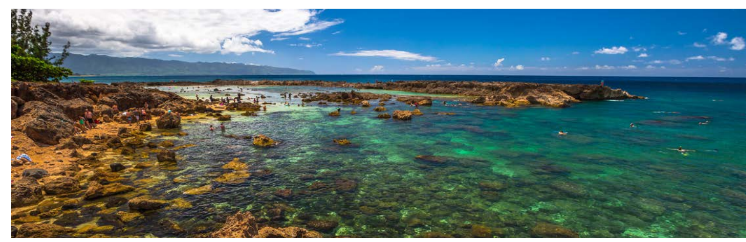
Coral reef in Hawaii

NFWF manages several national programs that have the potential to benefit coral reefs. These programs fund activities that range from working on farmlands to reduce soil loss, in cities to improve water quality and across state coastlines to reduce derelict fishing gear – all threats to coral reefs. Of particular interest, the National Coastal Resilience Fund (NCRF) has a strong nexus with the Coral Reefs Program Investment Strategy due to the overlapping habitat restoration focus and the importance of maintaining healthy reef structure for protection of many of U.S. coastal communities.