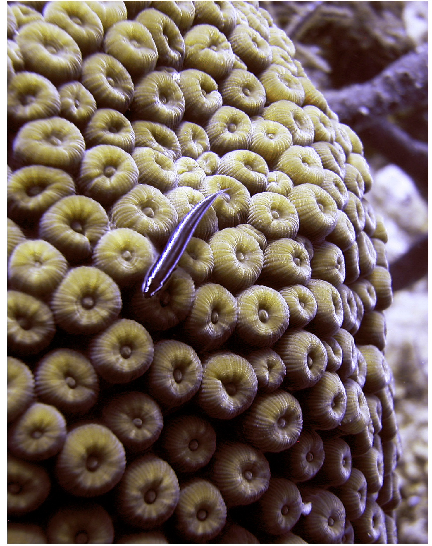
Wrasse on Coral Colony