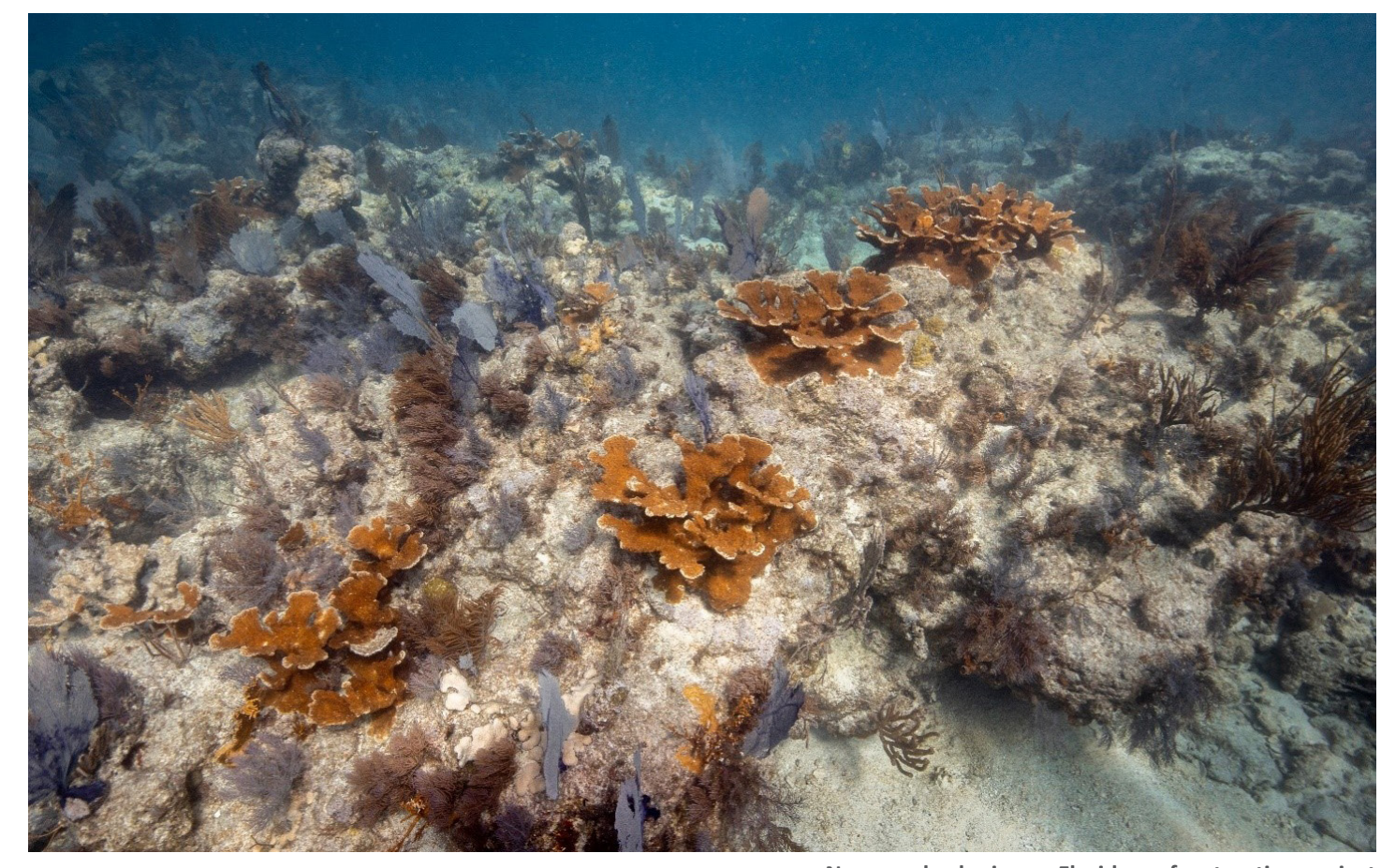
New coral colonies on Florida reef restoration project