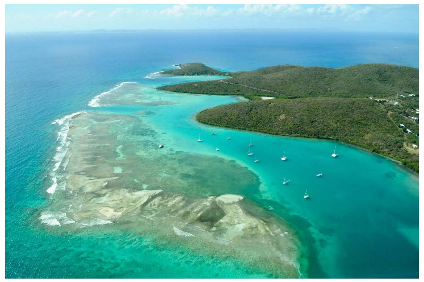
Island of Culebra, Puerto Rico

The 2009 business plan marked a change for NFWF, from investments focused on particular stressors across multiple geographic areas, to one in which we would focus on reducing multiple stressors in one particular area over a 10-year period. NFWF made this change based on the hypothesis that reducing local threats would promote natural recovery and build resilience in the wake of environmental stressors. During the period of the business plan, NFWF saw a greater than 30% increase in coral cover at the site—a return to pre-bleaching levels. NFWF also learned that a comprehensive site-based approach has value that extends beyond a specific location, research question or management tool as lessons learned in Guánica, Puerto Rico had direct relevance to other coral reef practitioners.