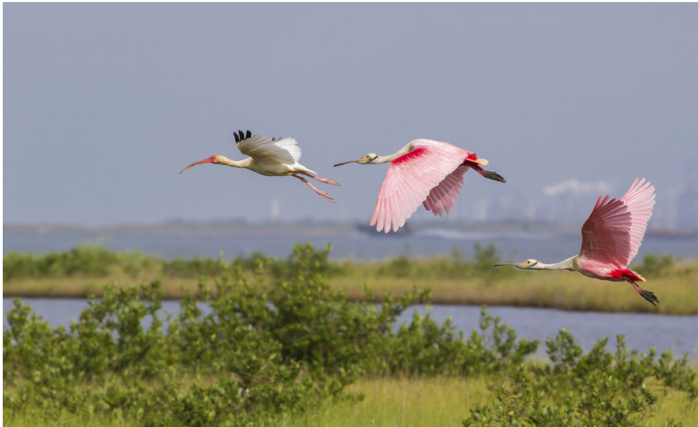
An ibis and roseate spoonbills.

Texas Parks and Wildlife Department (TPWD) will establish a program to support adaptive management actions needed to maintain, repair or rehabilitate projects funded by GEBF, including repair of damages from storms, vessel strikes or other causes. Additionally, these funds will allow Texas resource agencies, lead by TPWD and partners, to adaptively manage existing GEBF projects to enhance or expand ecological benefits and ensure their long-term sustainability in the face of dynamic conditions, as well as unforeseen circumstances (e.g. structure modifications, supplemental plantings, etc.). Lastly, these funds might be used to expand the scope of GEBF-funded projects and leverage future investments made by Texas natural resource partners to maximize conservation outcomes for the Texas Coast.