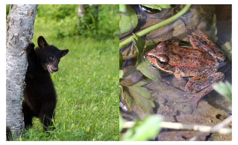
Black bear cub