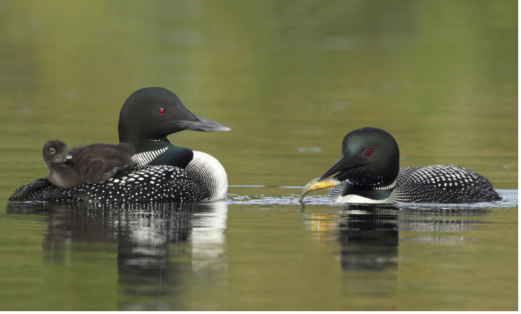
Loons in Maine