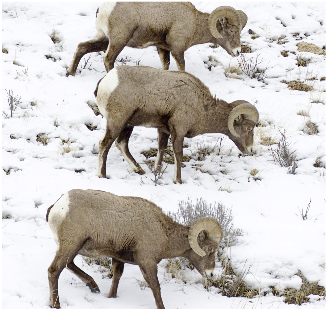
Bighorn sheep in Montana

1133 15th Street, NW Suite 1000 Washington, D.C., 20005 202-857-0166