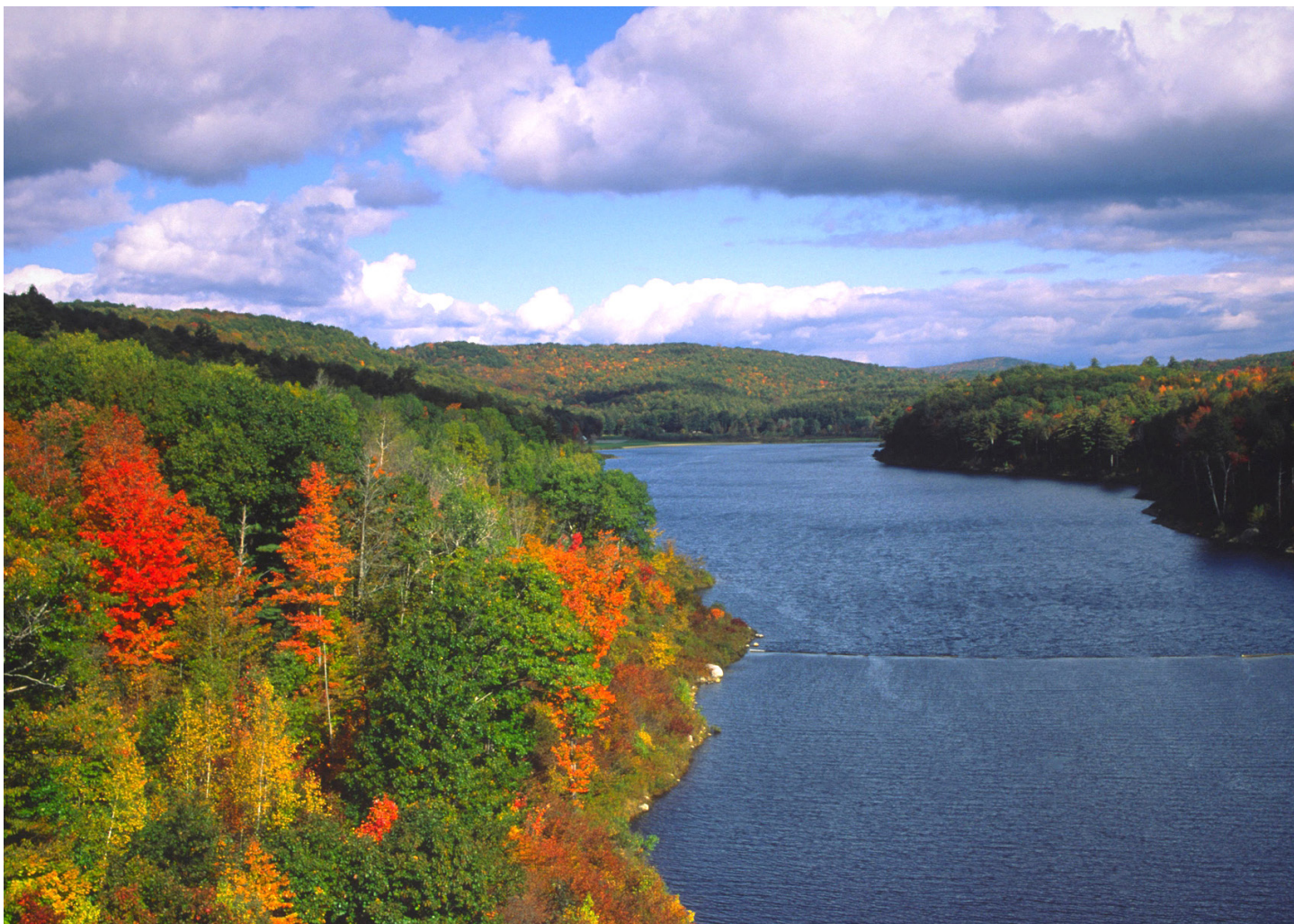
Connecticut River in southern New England