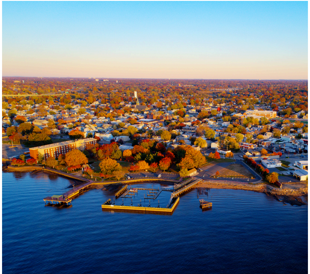
Delaware River, New Jersey

1133 15th Street, NW Suite 1000 Washington, D.C., 20005 202-857-0166