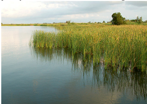
This project will advance the development of priority conservation outcomes for seven tidally influenced watersheds in Alabama.

This planning effort will help identify priority conservation outcomes for Mobile Bay and prioritize conservation projects that will restore and maintain the ecological functioning of this important estuary. This project will advance priority goals of the 2013-2018 Comprehensive Conservation Management Plan (CCMP) for the Mobile Bay Estuary; including improving trends in water quality in watersheds that discharge into priority fishery nursery areas and improving ecosystem function and resilience of the estuary through protection, restoration and conservation of habitats including beaches, bays, backwaters, and rivers. The goal of this project is to build upon the MBNEP's CCMP to identify specific projects that will address critical threats and protect and restore these watersheds.