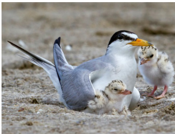
Dauphin Island provides critical habitat for beach nesting birds, such as the least terns pictured above.