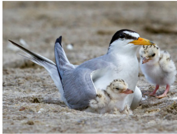
Dauphin Island provides critical habitat for beach nesting birds, such as the least terns pictured above.